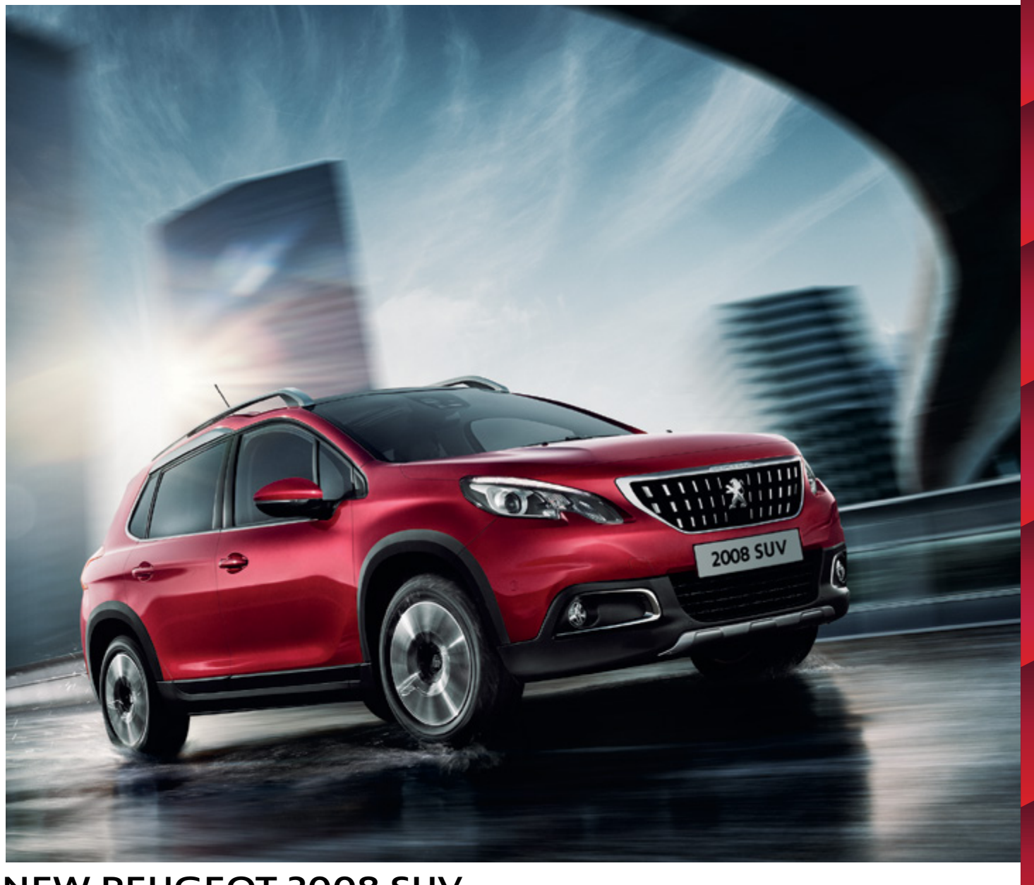
NEW PEUGEOT 2008 SUV